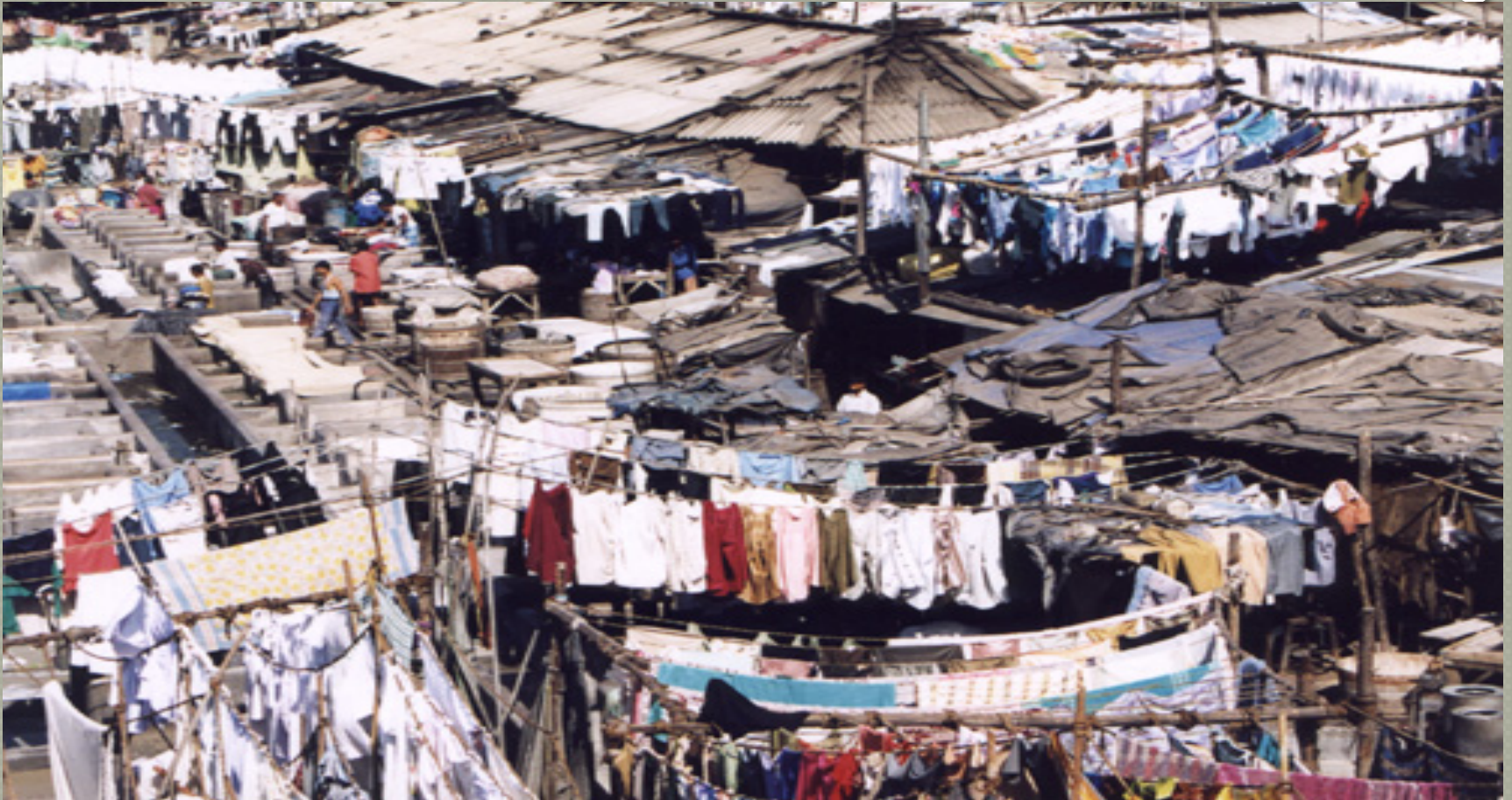
Mumbai (India) - housing